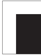
1/2 Pg. Island