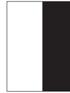
1/2 Pg. Vertical