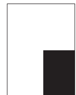
1/4 Pg. Vertical