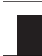
1/2 Pg. Island

Image Area: 7.25" x 9.75" Trim: 8.5" x 11" Bleed Size: 8.75" x 11.25"