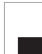
1/4 Pg. Horz.